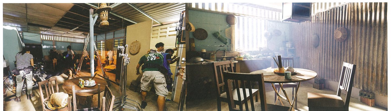
The kampong house was painstakingly populated with items from the 1950s, put together by the creative props team after much research.

To find out more about creating a named bursary, scholarship or professorship, please contact askdvo@nus.edu.sg or call 1-800-DEVELOP (1-800-338-3567).