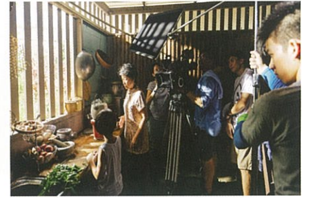
An old kampong in Buangkok was used to portray the young Mr Lee's house in the 1950s. Actors playing the young Mr Lee and his grandmother cook a potato for his school lunch.